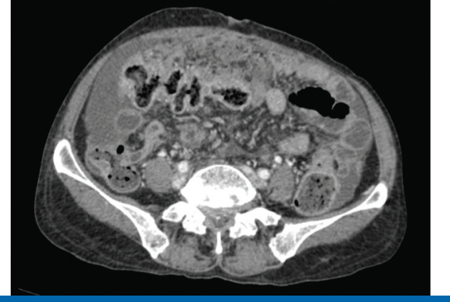
[Table/Fig-3]: Carcinomatosis peritonei in a 56-year-old male with adenocarcinoma. Axial CECT Abdomen image demonstrates omental caking, visceral peritoneal implants over transverse colon and parietal peritoneal implants in the left paracolic gutter.