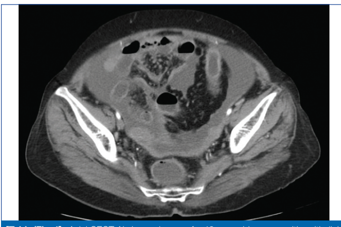
[Table/Fig-4]: Axial CECT Abdomen image of a 42-year-old woman with epithelial ovarian cancer shows peritoneal nodules and thickening of pelvic peritoneum.